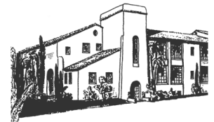
CHEREMOYA AVE. SCHOOL * 1915 - 2015 A CENTURY OF GROWTH