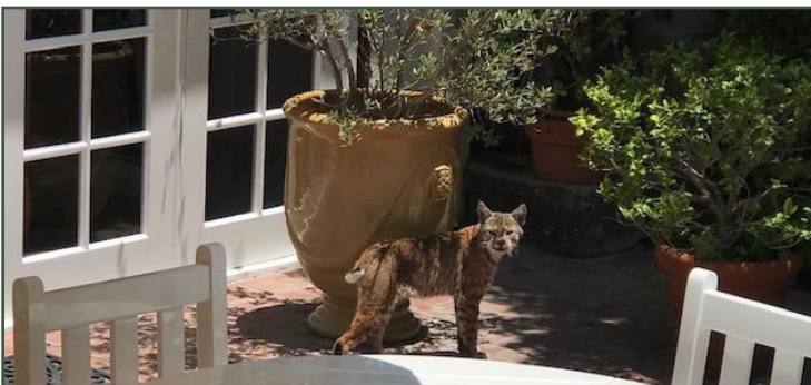
Thanks to the Beachwood residents who invite ALL of the neighbors to coffee.