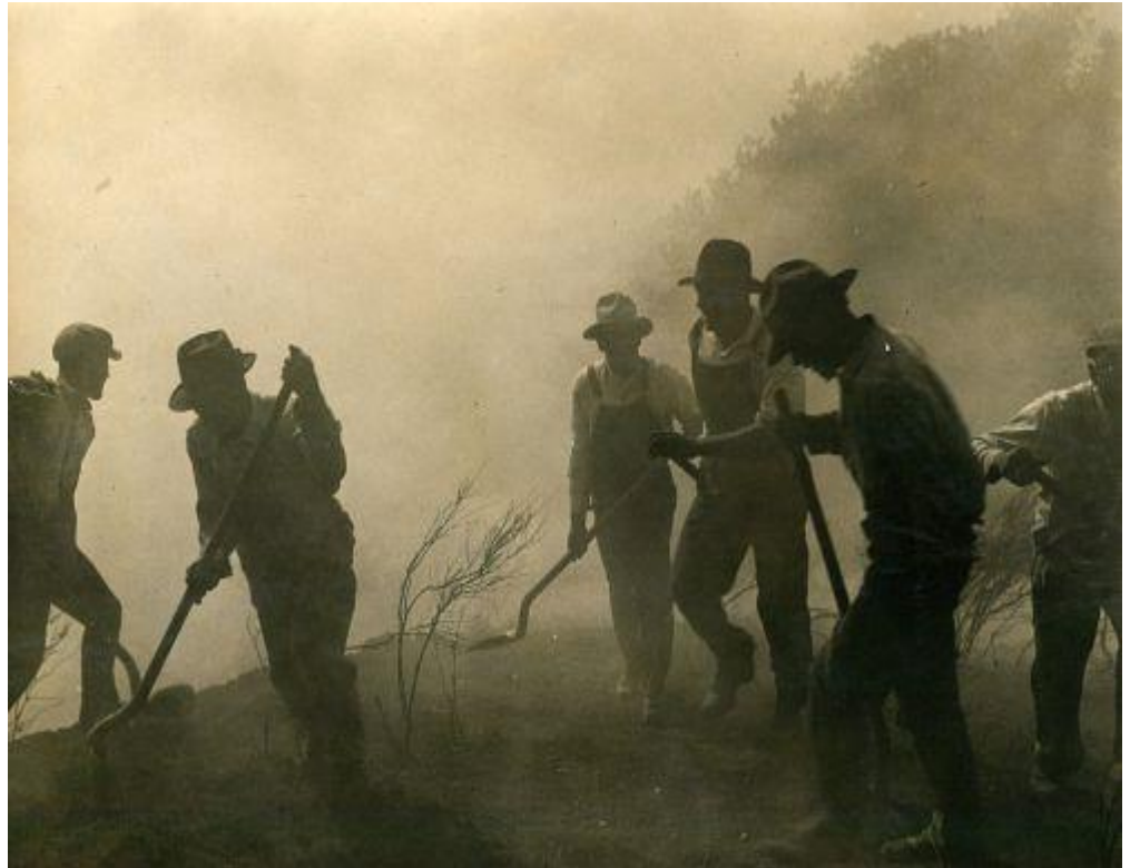
Click the photo for the article.

No smoking in the Park! Fines up to $1,000.00